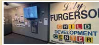
BLACK STORIES COLLECTIVE BLACK OWNED BUSINESSES ON DISPLAY THROUGH SEPTEMBER 28

Hear from Cedar Valley Black business owners and learn what it takes to start a business, how each business impacts the community, and what it takes to keep a business running.