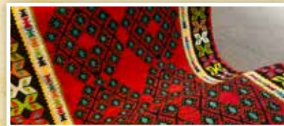
WHO WE ARE: BOSNIANS IN THE CEDAR VALLEY ON DISPLAY THROUGH NOVEMBER 2

Hear from Cedar Valley Black business owners and learn what it takes to start a business, how each business impacts the community, and what it takes to keep a business running.